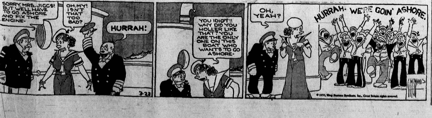
BY GEORGE MCMANUS

BUSINESS MAN CYCLING CAPE TOWN - (Canadian Press) - Cycling, which lost favor in South Africa as far back as 1895, is returning to popularity - not so much as a sport as a means of transportation. Workers who live some distance from Cape Town have bought bicycles and ride to work because they say it's cheaper than using the trolley lines.