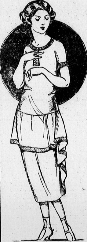
Over-the-Skirt Blouse of Crepe de Chine

back on the head, not down on the eyebrows and bridge of the nose as in the past two or three seasons.