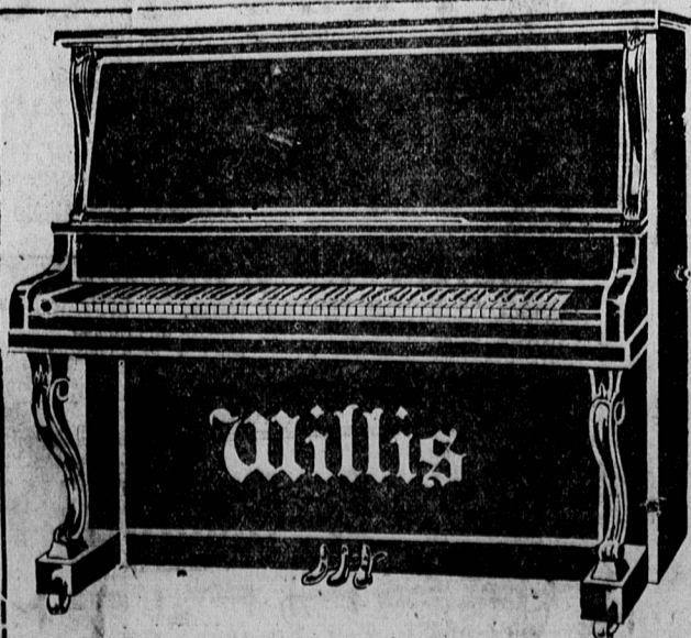
$500.00 Willis Piano, First Prize in District Number Three.

For Further Particulars Address, Contest Manager Charlottetown Guardian, Charlottetown. P. E. I.