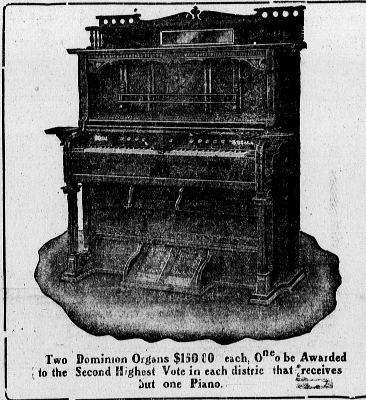
Two Dominion Organs $150.00 each, One to be Awarded to the Second Highest Vote in each district that receives but one Piano.

Charlottetown Guardian, Charlottetown, P. E. I.