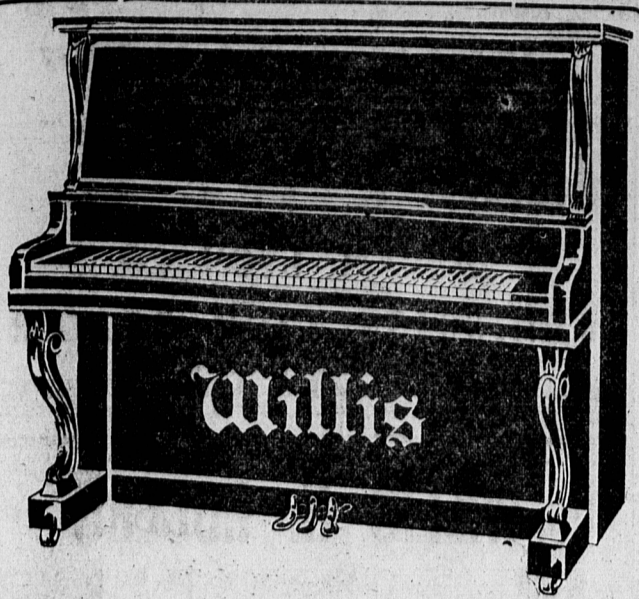
$500.00 Willis Piano. First Prize in District Number One.