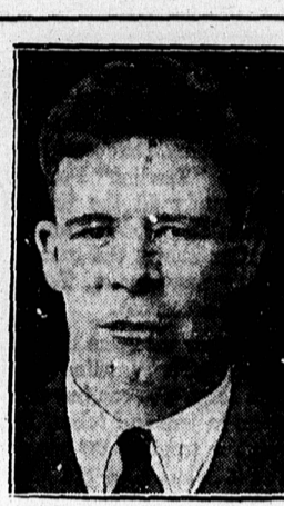
STANDS TO WIN FORTUNE