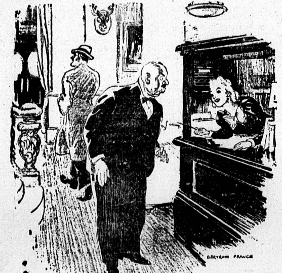
Cashier (to note manager): "That man must be rolling in money. I've been cashing cheques for him all day."—Humorist.