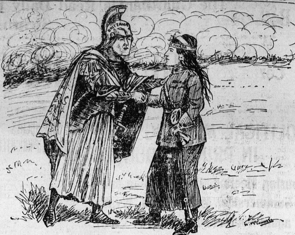
TO MY LAST SON AND DOLLAR, MOTHER