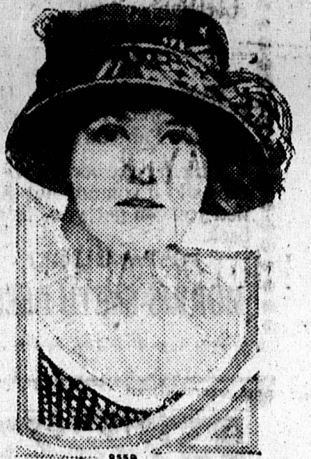
MARGUERITE CLARK "Little Miss Hoover"