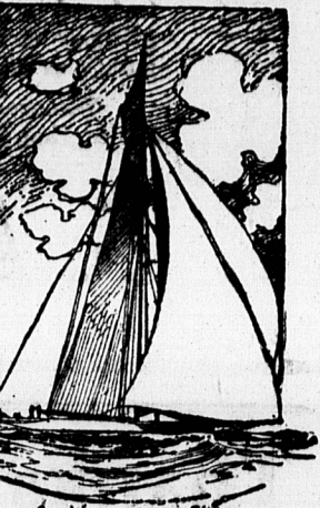
AMERICA'S CUP DEFENDER

Let your medicine be Dr. Hamilton's Pills. They do cure so thoroughly. Sold by all dealers, 25c. per box, or five boxes for $1.00. By mail from N. C. Polson & Co., Kingston, Ont., and Hartford, Conn., U. S. A.