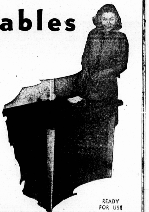
READY FOR USE

ON SALE FRIDAY and SATURDAY Guaranteed Satisfaction Since 1857