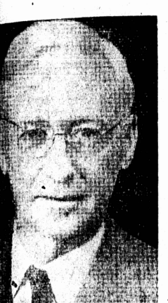
PREMIER JOHN HART

VICTORIA, B.C., Aug. 31—(CP)—A general election in British Columbia will be held Thursday Oct. 25, Premier John Hart announced today. Nomination day will be Oct. 11 and the 20th Legislature was dissolved today. The last British Columbia general election was held Oct. 11, 1941. Standing at dissolution today was Government Coalition 30 (10 Lib. 11 Prog. Con) C.C.F. 15, Ind.-Lab. 1, Lab. 5, Vacant 1.