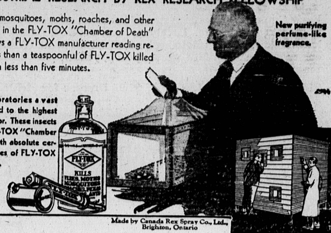
Made by Canada Rex Spray Co. Ltd., Brighton, Ontario

Death to insects, but absolutely harmless to people