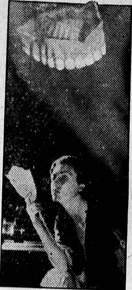
False teeth often follow pyorrhea, which comes to four people out of five past the age of 40

Even when gums are in the best of condition, Forhan's is a fine precaution. It is so pure, so mild, so free from harsh abrasives that it cannot do the slightest harm, even to the delicate tooth enamel of children. Forhan's Limited, Montreal.