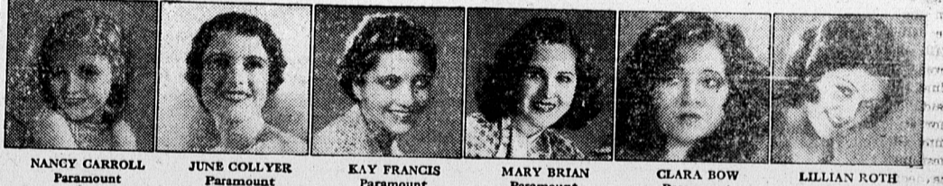
NANCY CARROLL Paramount JUNE COLLYER Paramount KAY FRANCIS Paramount MARY BRIAN Paramount CLARA BOW Paramount LILLIAN ROTH Paramount