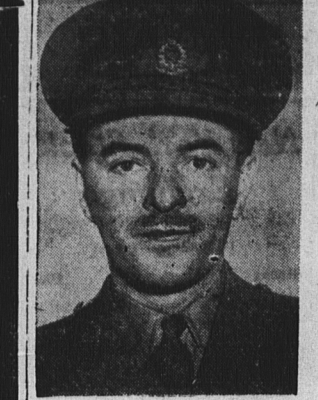
HEADS "BLITZ" DOCTORS

LONDON.—(CP)—Many European refugees, industrially partly financed by their own money plus government relief of rent and taxes, have sprung up in the Team Valley Estates of Northeast England and the Treforest Estate in South Wales.