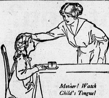
Mother! Watch Child's Tongue!

secretly, every wife is fiercely ambitious for her husband—his success, appearance, strength—his standing among his fellow men. is worthy of that wife of yours. Keep healthy! strength, appearance, success depend on health. Living habits today are largely artificial—indoor—sedentary. To be healthy, we must regard Nature's laws. And one of the first of her laws is "Avoid constipation. Keep the poisons of intestinal matter moving out of your body." by an entirely new principle Nujol will keep the poisonous waste moving out of the body. Every other form of treatment either irritates or forces the system. Nujol works on the waste matter instead of on the system. Nujol prevents constipation by keeping the food waste soft, thus helping Nature establish easy, thorough bowel evacuation at regular intervals—the healthiest habit in the world. is absolutely harmless and pleasant to take—try it. Nujol is sold by all druggists in sealed bottles only bearing Nujol trade mark. Write Nujol Laboratories, Standard Oil Co. (New Jersey), 50 Broadway, New York, for booklet "Thirty Feet of Danger." A New Method of Treating an Old Complaint