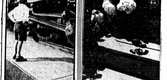
Left: A boy and an engine—a logical shot, yet how often overlooked. Right: What! A picture of the back steps? But the flower and its shadow provide the necessary interest.

SOME folks have the notion that the only pictures worth taking are those of unusual things. They take a camera along when they travel and never use it at home, unless something special is happening. Yet the simple fact of the matter is that some of your finest picture possibilities are at home, around the house. "But," you may say, "I've already made good snaps of the house, the family, the pets, the garden and the new car. What else is there to shoot?" Nobody can answer that question for you, directly. But it's dollars to doughnuts that there are dozens of other picture possibilities. And all of them as interesting as the ones already in your album.