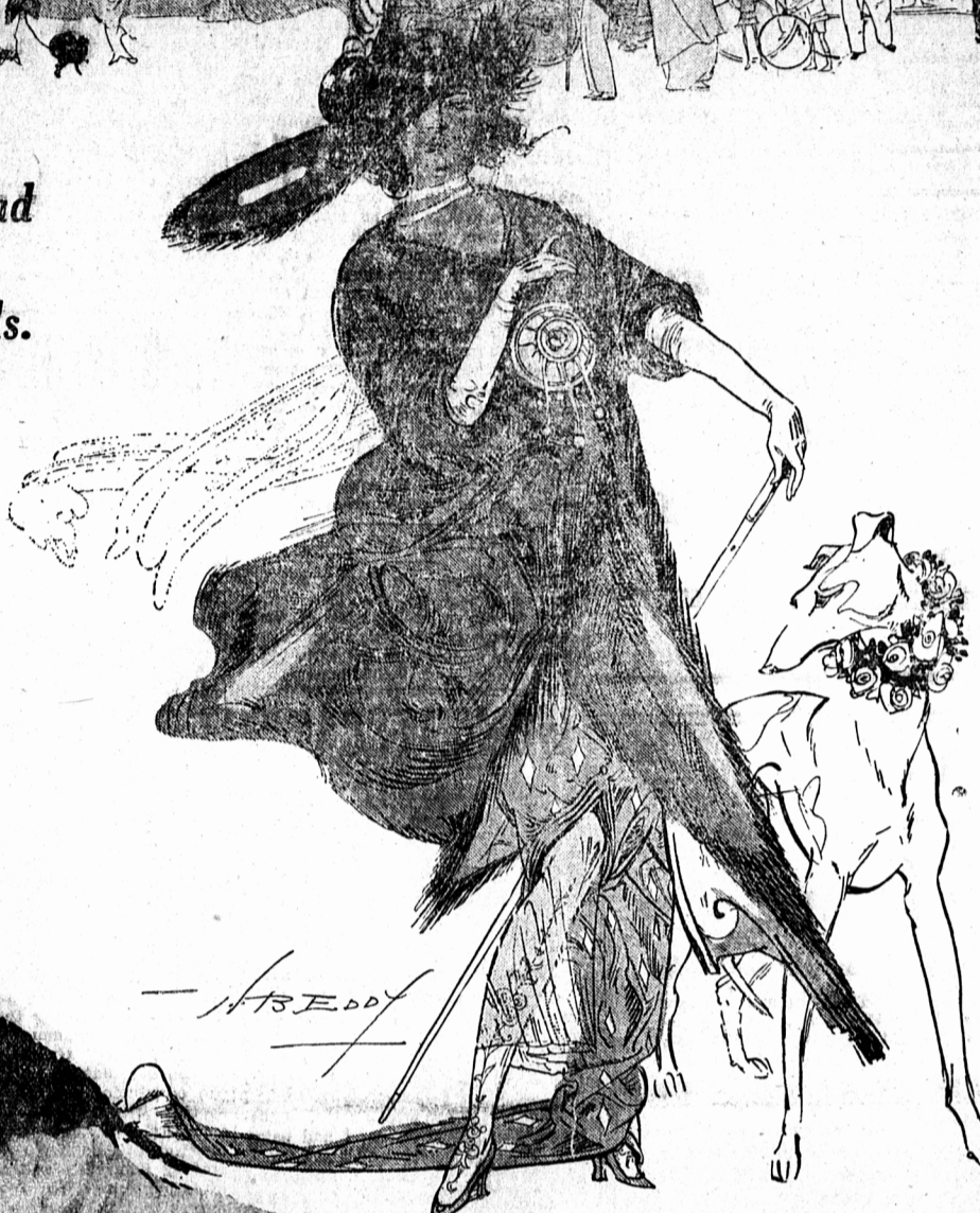
"Behold the most up-to-the-second Lady of the Boulevards, the exponent of the extremes of fashion. With nonchalance she wears the loop hole skirt, the rainbow face, the puff-ball hat and painted furs. And to fit the picture even her greyhound painted in colors that match her gown, wears a ruff of jewelled roses round his neck."

painting fox the most delightful shades of blue and green. We are dyeing fur wraps a lovely royal purple. In fact, there is nothing we dare not attempt. I have seen a delightful pink chiffon evening gown trimmed with bands of pink ermine. This fur, by the way, being flat, is more susceptible to paint than to dye. It is a liquid water