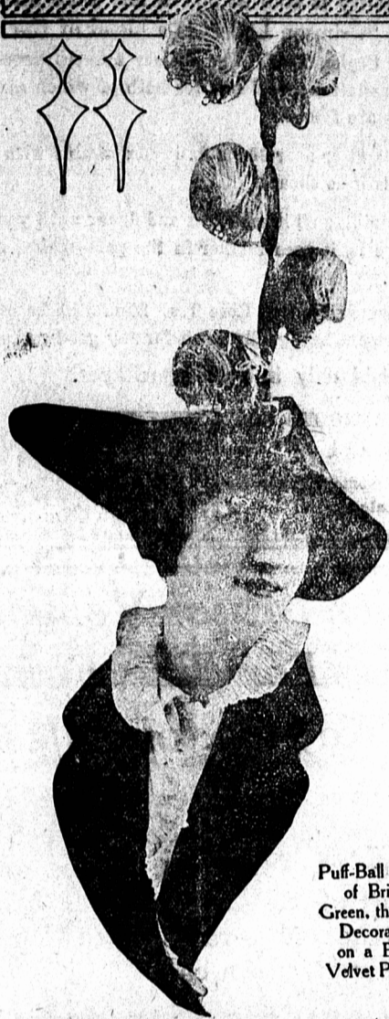
Puff-Ball Plume of Bright Green, the Only Decoration on a Black Velvet Plaque.

Fur Dyed to Match Gowns and Faces Painted to Match Modes and Furs, Skirts with Holes Instead of Slits, and Puff-Ball Hats Are Among the Latest Paris Fads.