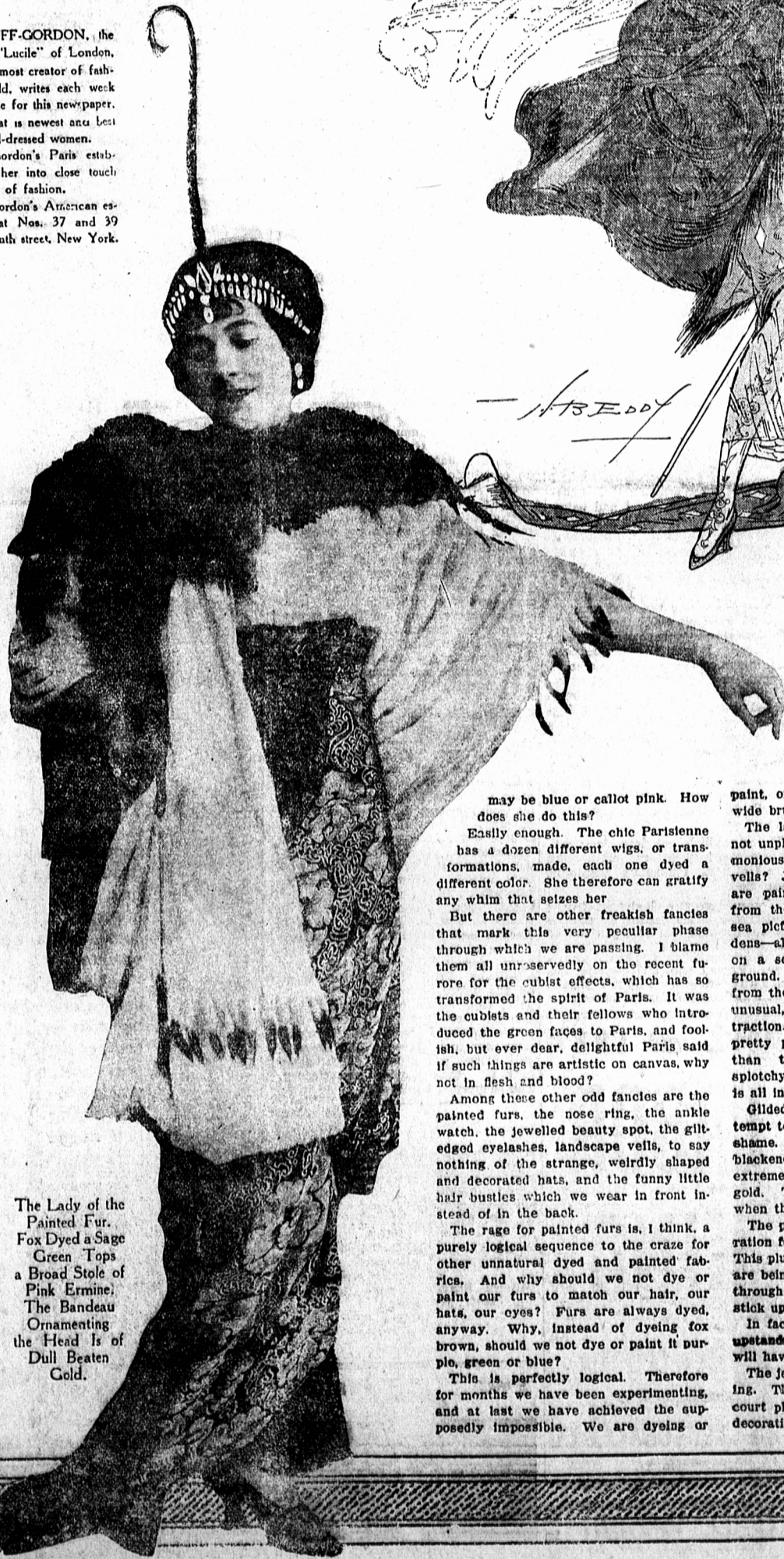
The Lady of the Painted Fur, Fox Dyed a Sage Green Toss a Broad Stole of Pink Ermine, The Bandeau Ornamenting the Head Is of Dull Beaten Gold.

LADY DUFF-GORDON, the famous "Lucile" of London, and foremost creator of fashions in the world, writes each week the fashion article for this newspaper, presenting all that is newest and best in styles for well-dressed women. Lady Duff-Gordon's Paris establishment brings her into close touch with that centre of fashion. Lady Duff-Gordon's American establishment is at Nos. 37 and 39 West Fifty-seventh street, New York.