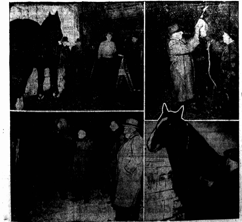
Although the port of Montreal is frozen solid these days, agents of the French Supply Mission in Canada are hard at work buying horses for shipment via the port of Portland, Maine. These pictures were taken down at the Montreal Stockyards recently and show the inspectors of the Supply Mission passing on some very excellent Percherons. These horses are branded on the hoot and the shoulders.