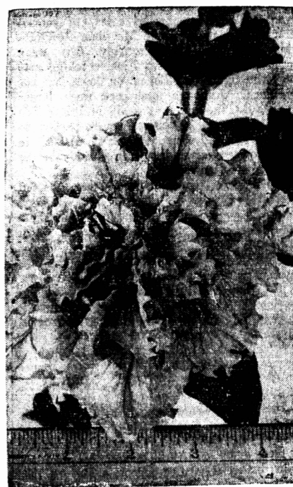
scale planting with hybrid seeds will soon be profitable.

The only new vegetable in 1946 to merit attention is Longgreen. It is a green snap bean, longer than Tendergreen, is round in shape and high table quality. Up till now the cost of hybrid vegetable seed has limited their use. However, the cost of field operations, such as pollinating tomatoes shown in the picture above, is being reduced and it is expected that even large