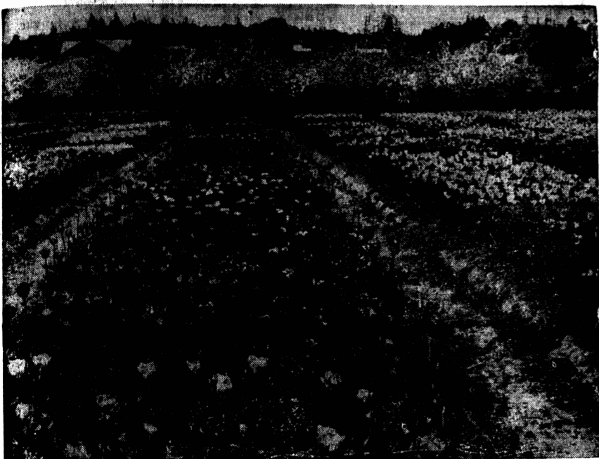
The cool temperate climate of Vancouver Island and certain portions of B. C. mainland, made particularly suitable for the production of delicate bulbs imported from Holland. Picture shows a large field of tulips making up part of the fast-growing bulb industry on the west coast.