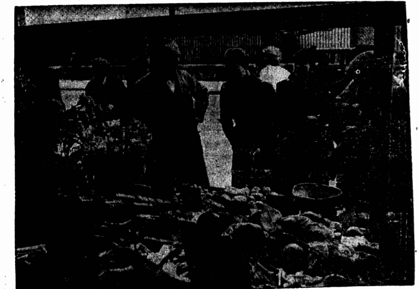
Harassed British housewives find one bright spot in the food picture in the vegetable market. The supply is plentiful, which is fortunate, as the contrast of scarcity in other foodstuffs makes the task of getting nourishing family meals quite difficult.