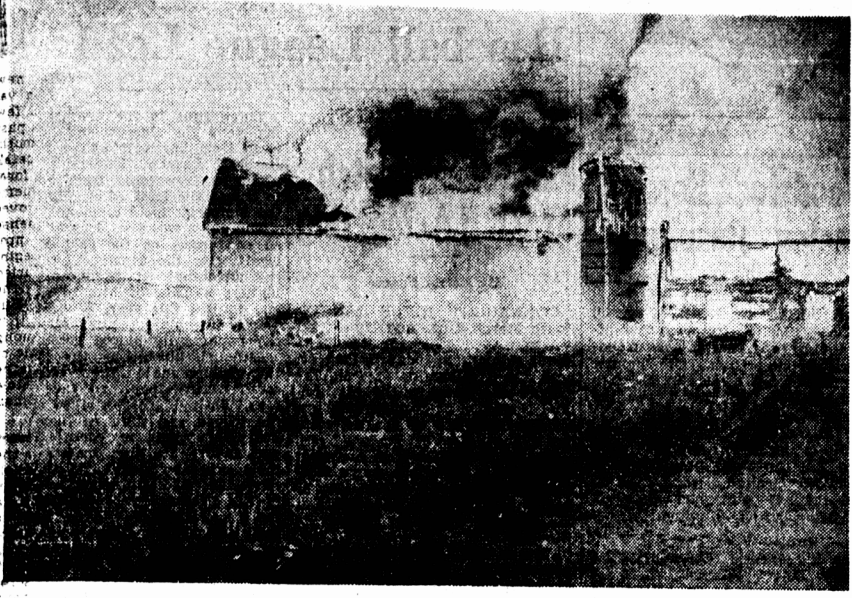
Shown above is a close up picture of the lower end of the burning barn and a burning silo cutting Sunday's fire at S.D.U. The cattle were all in the part of the barn pictured above. Behind this barn were the horse stable and the pigsty.