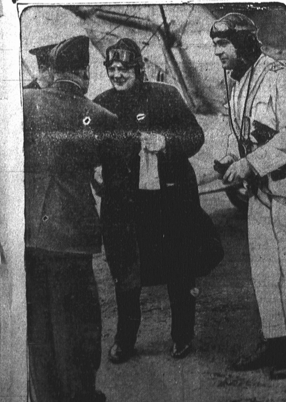
Hon. Winston Churchill, recently made Honorary Commander of the Auxiliary Air Force, a body of civilian citizens who train in spare time, is shown being greeted on his arrival by air at Kenton R.A.F. station, on a tour of inspection. The honorary commission will be in effect until the end of the year.