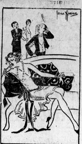
"Now-a-days a dead party is one where nobody's shot."