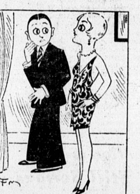
PROBABLY HIS ACTING Would-be Actor: There's only one thing that keeps me off the stage. Girl Friend: What's that—your acting?