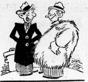
COULDN'T MOVE "He didn't seem able to come back at you in the argument then." "No, I nailed him that time."