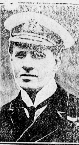
FOR AND AGAINST NAVAL BASE.—When the British admiralty's plan to erect a naval base at Singapore was under discussion in the House of Commons, George Lambert (left), former civil lord of the admiralty in the Asquith government, strongly criticized the proposal, which was equally vigorously defended by Commander Burney (right), a naval expert.