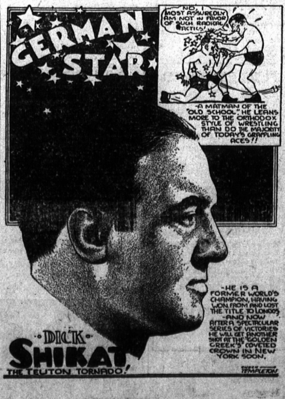
DICK SHIKAT THE TELTON TORONDO! THE IS A FORMER WORLD CHAMPION, HAVING WON THE TITLE TWICE AND NOW AFTER A SERIES OF VICTORIES HE HAS BEEN CALLED UP TO RACE IN NEW YORK CITY.