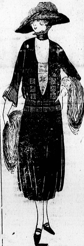
Tailored Frock With Unusual Neck Arrangements

minute with fashion information, confessed recently that the spring styles are really not at all startling, that no silhouette innovations have put in their appearance, and that the designers who discover or invent the greatest number of new minor style notes will be the most successful. The gist of his fashion resume was simply that whatever is new, and beautiful will be the style, and the designer, whether professional or otherwise, who has the most highly developed