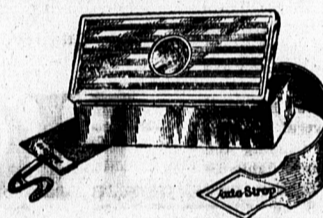
No. 251.—Embossed nickel-plated case. Same contents as No. 1. Can also be had in plain and embossed cases, finished in gun metal and gold. Price, complete, $5.00.