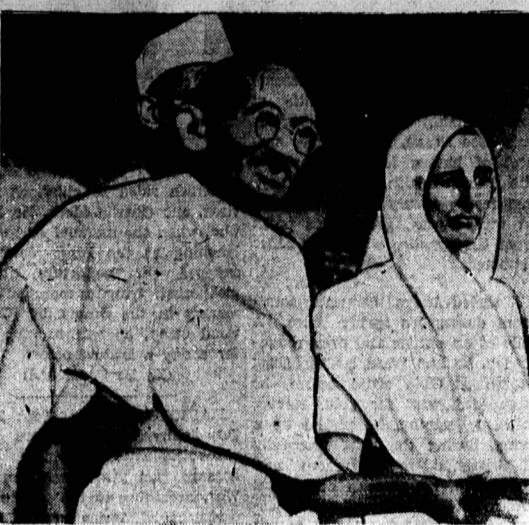
ARRIVES FOR ROUND TABLE CONFERENCE Mahatma Gandhi, famous Hindu leader, and Mira Bai (RIGHT), former Miss Madeline Slade, embarks on steamer for London. Daughter of a British admiral not so long ago Miss Slade turned worshipper and servant to India's greatest figure.