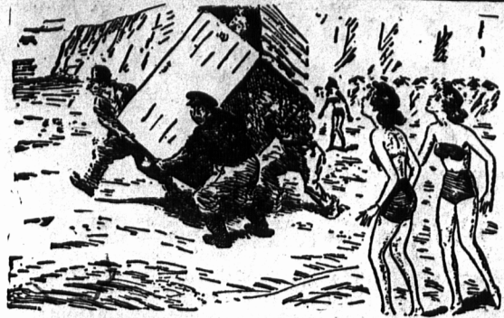
"We can't find the key of the box, but he says he can't wait for his dip until it's found."—London Opinion.