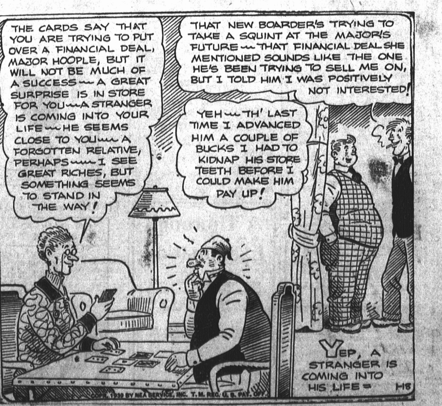
OUR BOARDING HOUSE - With - Major Hoople