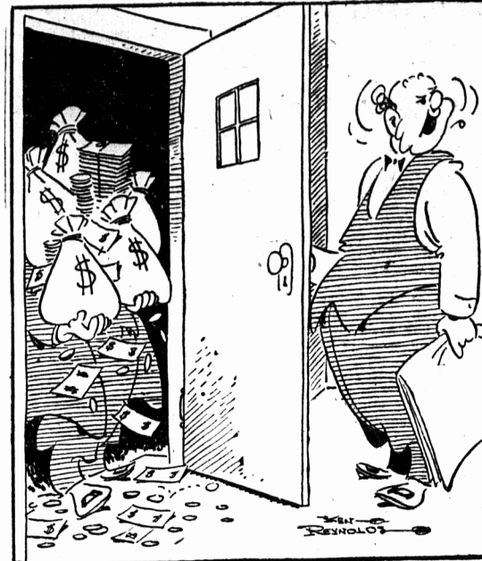
"Mary, about that Guardian Want Ad offering our house for sale, we've got an answer — I think!"

South should have cashed the spades, eliminating that suit from both hands, then should have cashed the club ace and played the club queen! It would not matter which defender took this trick; he would have to return a diamond, thus giving declarer an automatic finesse against the queen, or, by leading another club or spade, permit South to discard a diamond from one hand while he ruffed in the other.