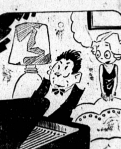
The Artist: One who is sincerely devoted to music must not love money. Miss Sweet: I infer that from the scale of prices for every big performance.