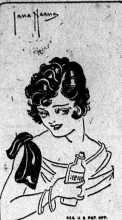
"A vamp used to have a wicked glint in her eye—now she has it in her hair."