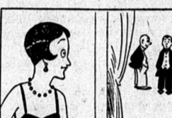
"What do you think of a girl who would break her promise?" "I should have to know what the promise was."