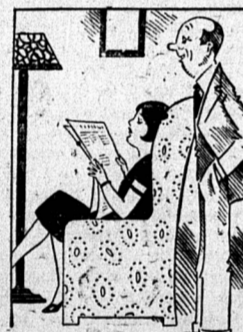
"Here's a story which says the heroine thanked him with a look." "If I suppose her gown was so tight that she couldn't trust herself to speak, eh?"

Pipes for the distribution of coke-oven gas are to be laid between some of the largest cities in France.