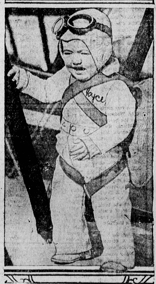
NO CRIB FOR THIS AIR BABY