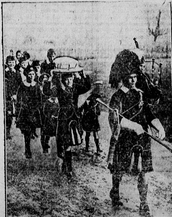
SCOTS PREPARE FOR FESTIVE SEASON

Mr. Winston Churchill, noted British parliamentarian and author, who visits Canada the middle of next month, Mr. Churchill arrived in New York on Dec. 10, on a visit to Canada and the United States. He is now convalescing in his New York apartment after sustaining painful injuries in an auto accident.