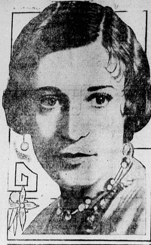
MARRIED BEFORE WAS CHARGE OF WL

Premier Bennett (LEFT) and G. Howard Ferguson, Canadian High Commissioner in London, RIGHT, seen recently with the mayor of Southampton, Eng. Premier Bennett returns to Canada with assurance of the British premier of a wheat quota which will likely be adopted.