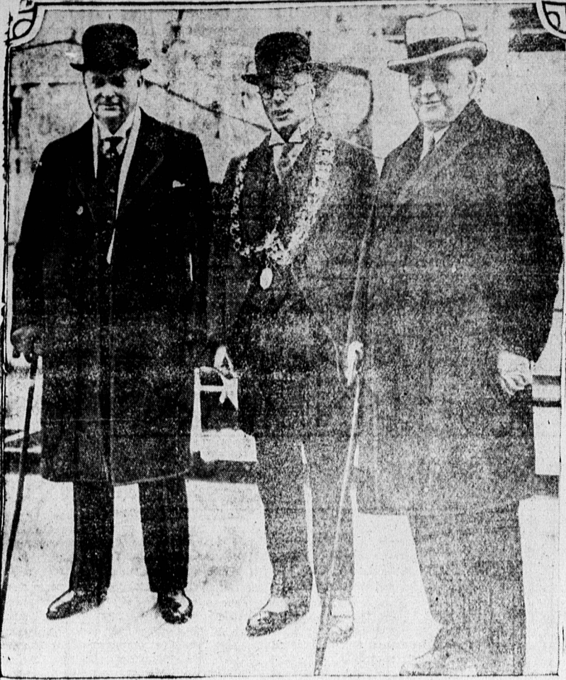
MEET IN LONDON

Premier Bennett (LEFT) and G. Howard Ferguson, Canadian High Commissioner in London, RIGHT, seen recently with the mayor of Southampton, Eng. Premier Bennett returns to Canada with assurance of the British premier of a wheat quota which will likely be adopted.