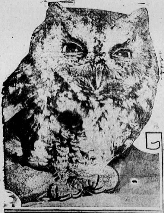
DWL CRASHES SOCIETY—PEEVED—WONT BE INTERVIEWED