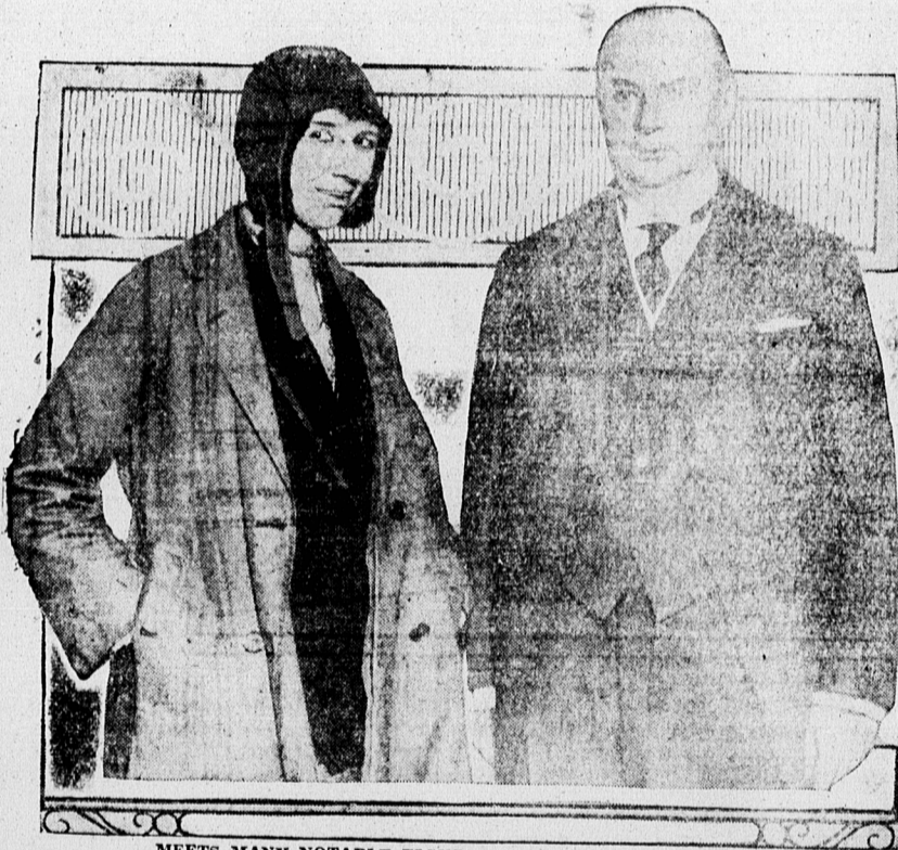
MEETS MANY NOTABLE FIGURES DURING LONDON VISIT