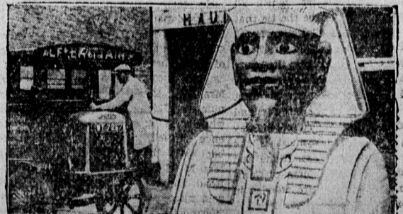
A PROBLEM FOR FUTURE EGYPTOLOGISTS

These bonnie Scots lads at Royal Caledonia schools at Bushey, Eng., are bringing up the Christmas in rope-style, all ready for the big doings not so far off.