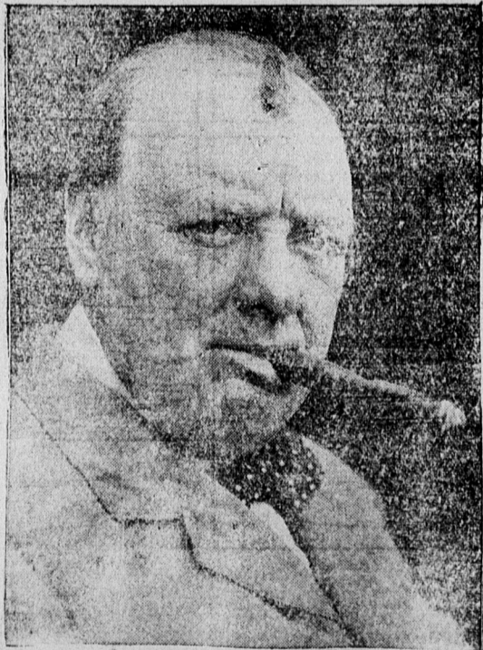
TO VISIT CANADA AND STATES

When members of the Mallory family, Toronto came down to breakfast the other day, they found one very much annoyed black horned owl perched in the dining room, with pictures and other ornaments strewn about the floor. The bird (shown ABOVE), angrily fended off all advances, and the photographer, even, was unable to photograph it until representatives of the Humane Society arrived. It had entered the room by the chimney.