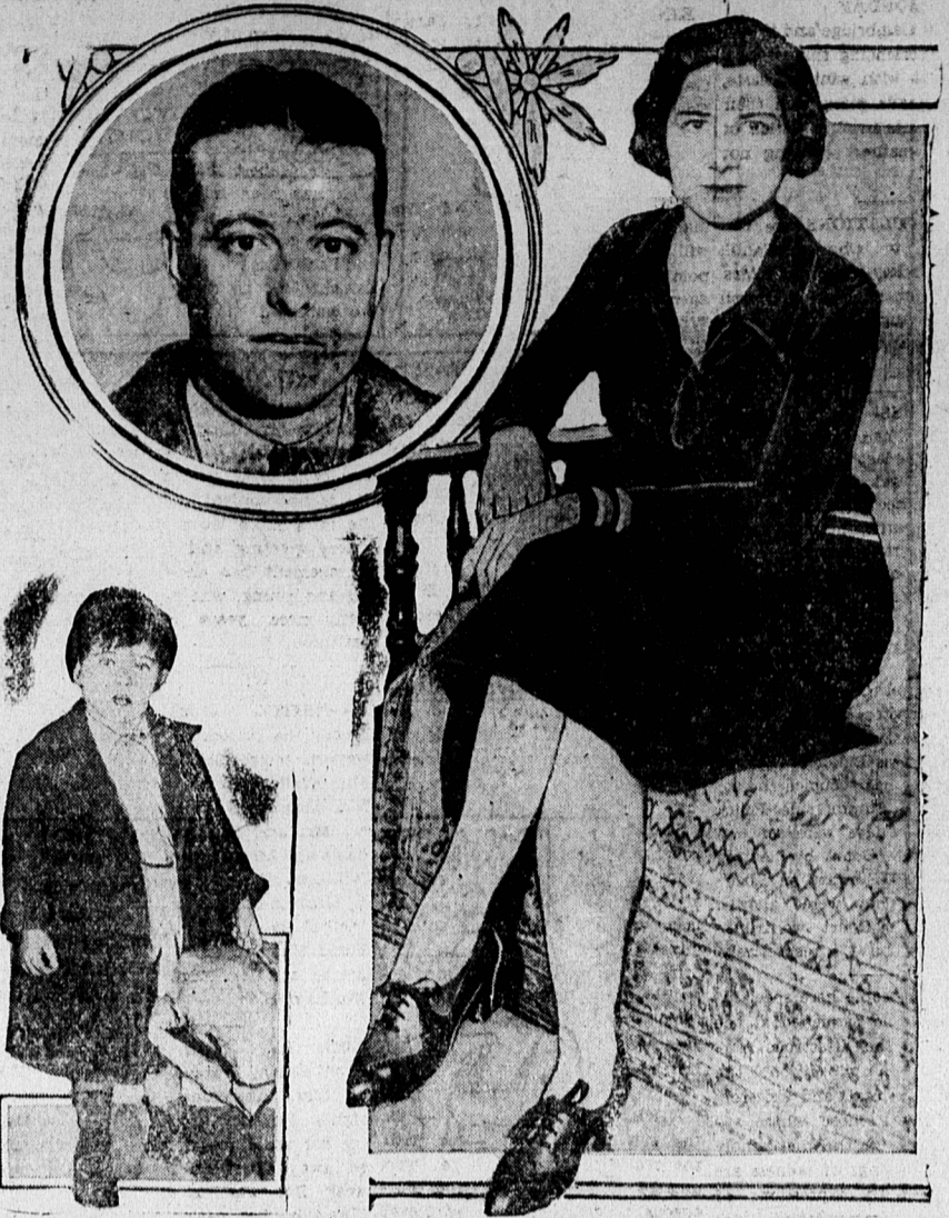
GRANNY LEFT HIM