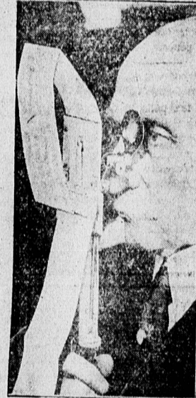
BOOKS, FIVE CENTS!