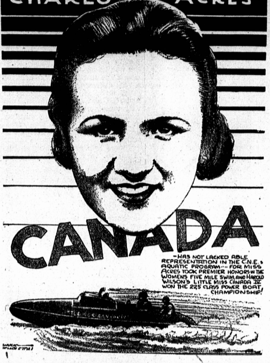
"HAS NOT LACKED ABLE REPRESENTATION IN THE CANADIAN SPORTS PROGRAM—FOR MISS FORCES TOOK THEM TO HEADQUARTERS OF WOMEN'S FIVE MILE SWIMMING MEET AT WILSON'S LITTLE MISS CANADA 25 FOR THE 25th CANADIAN BOAT CHAMPIONSHIP!"