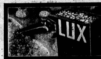
Lux Soap Makers by appointment to their Excellencies the Governor-General and Viscountess Willingdon