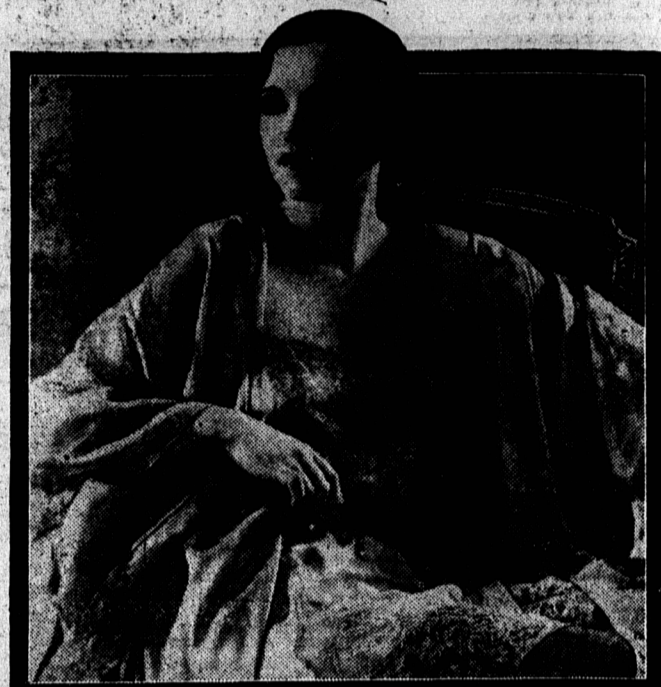
Some wives keep romance in marriage forever—isn't one secret the trousseau habit?

To this I reply, that is too often the case, but it need, never be so if women faithfully use that invaluable product, LUX—which is made especially to cleanse without disturbing the vibrant loveliness of the colours. If a garment is safe in clear water alone, it is just as safe in LUX.