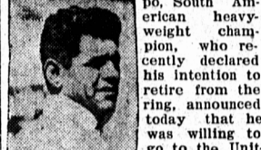
Luis Angel Firpo.