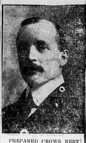
PREPARED CROWS NEST REPORT