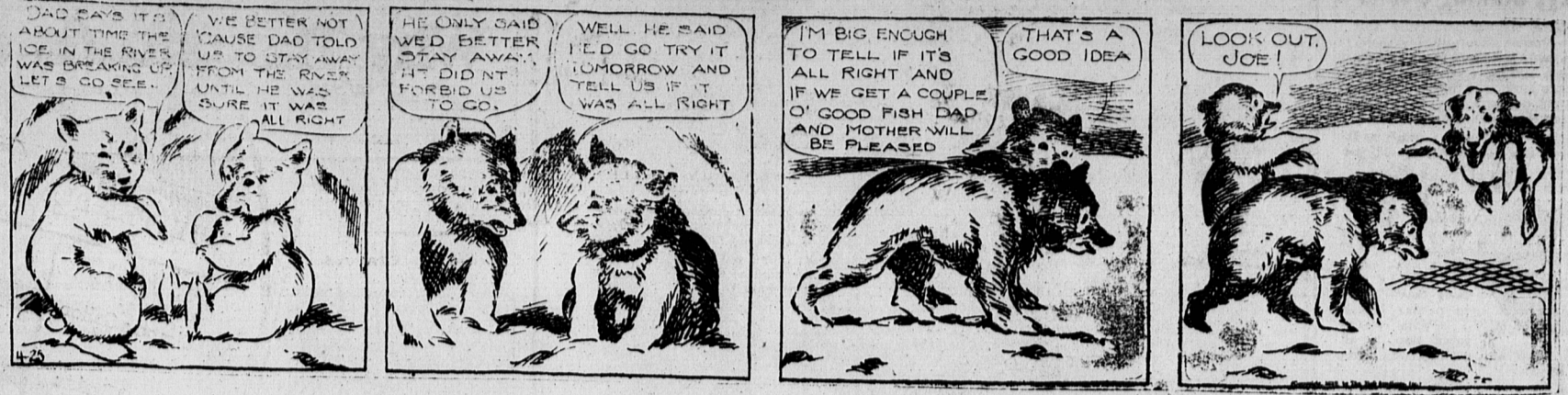
Jimmy Turns the Trick!