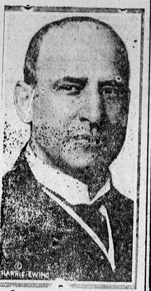
Governor William C. Sproul

Although it is yet uncertain as to who Senator Boise Penrose will support at the Publican National Convention, it is said that the first ballot of Pennsylvania will be for