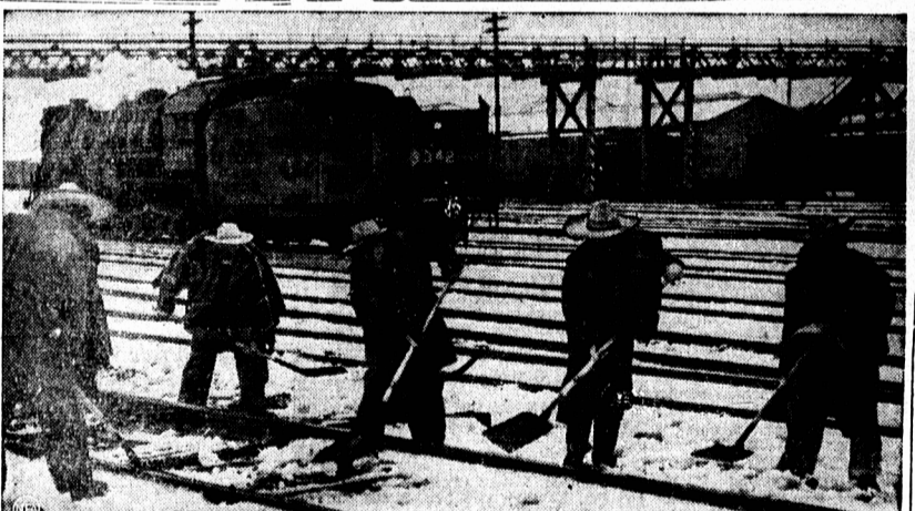
Wearing straw sombreros and colorful serapes, Haven and Hartford Railroad. A shortage of track these newly-arrived Mexican laborers see their first workers resulted in the importation of 300 section men and under a six-months contract which guarantees them Mexican food, newspapers and nowareels.