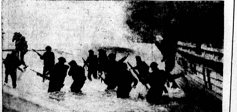
With the invasion of Europe looming as the greatest blow of the war, Canadian troops in Britain are training night and day for the epochal landing. This picture, just received from overseas, shows how the men might be launched on their grim attack against hostile shores. In these practise manoeuvres, the beach, loaded with heavily armed fighting men, make a quick trip out to sea then turn back toward a specially prepared strip of beach. The men leap from the assault boats under a thin smoke screen spread by the Royal Navy, which will have a major invasion role, and half-wade, half scramble ashore waist deep in water. Bren gun bullets whine overhead.