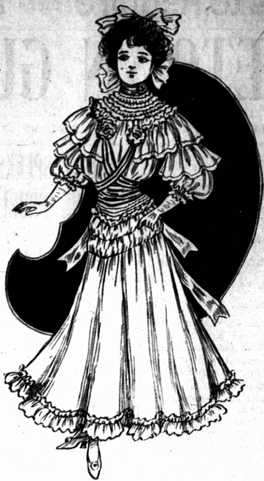
Showing a pretty dressy frock for young girl. The material is light blue silk batiste over green satin. The ribbon is a shade darker than the batiste. White gloves and slippers are worn with it in the evening.

It is a notable and somewhat mysterious fact that of the hundreds of Russian officers who surrendered at Port Arthur only eighty would accept the offered privilege of release on parole. The rest preferred to remain prisoners of war. One explanation offered is that they expect a victorious advance of the Russian forces next spring when many Japanese prisoners will be taken and they may be exchanged and be free to fight again. If now released on parole they would be excluded from fighting again during the present war. The Japanese would be glad to have them all paroled, and thus be freed from the cost of maintaining them. It will cost Japan as much to maintain and guard the 20,000 prisoners taken at Port Arthur as to maintain a like number of her own men in the field.