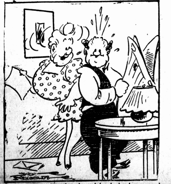
"Daughter writes that she and her husband are very happy since they found an apartment with a Guardian Want Ad—now must visit them!"