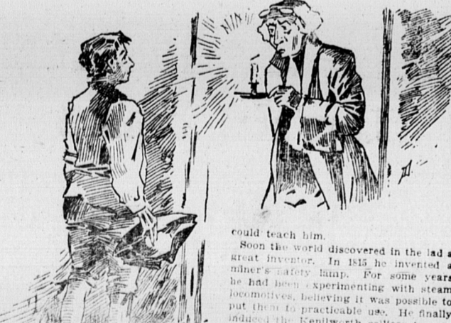
WHAT DO YOU WANT?

TURNING his head neither to right nor left, the roughly clad boy made his way up the path leading to the house of Wylam's schoolmaster.