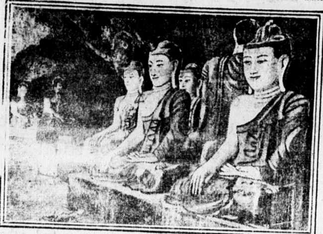
THE GREAT CAVE, WITH ITS IDOLS OF BUDDHA

AND here, little one, are the durlans I promised thee. The going smiled broadly as he saw the rapture with which little Nika accepted the capacious bag filled to its brim with the luscious durlans.