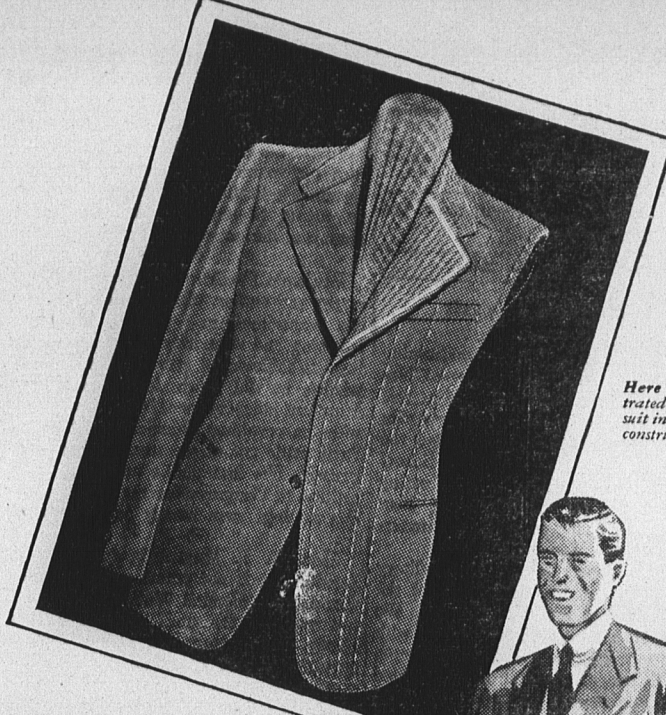
Here is illustrated a Tip Top suit in process of construction.