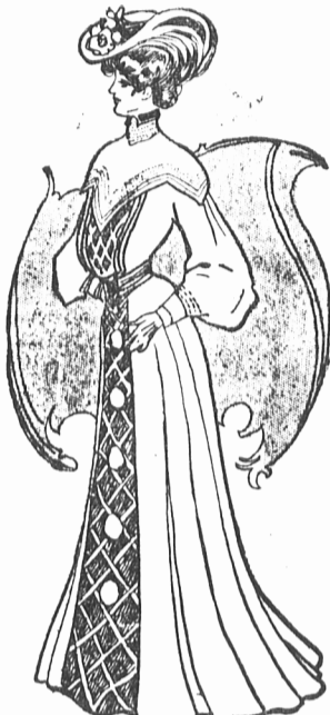
PAWN CLOTH GOWN.

Some of the new skirts are made with three folds finishing the lower