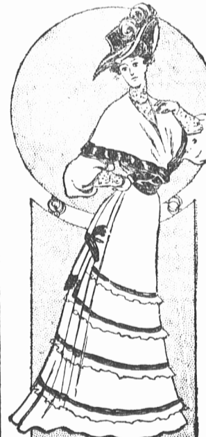
OLD ROSE FRIEZE GOWN.

Some house gowns are made after the fashion of a housemaid's skirt.