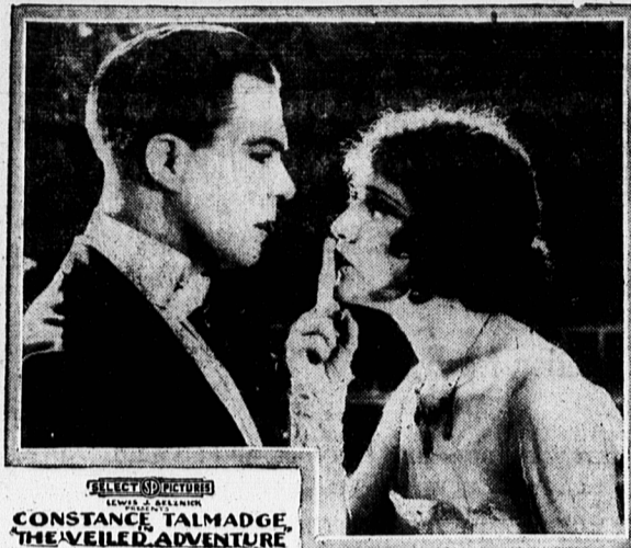
CONSTANCE TALMADGE THE VEILED ADVENTURE