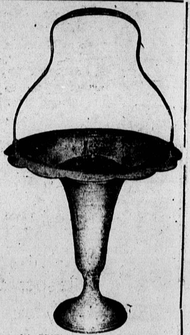
1st PRIZE SILVER CONTEST BASKET