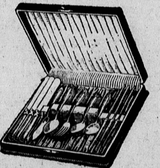
2nd PRIZE—DISTRICT CONTEST CABINET OF SILVER