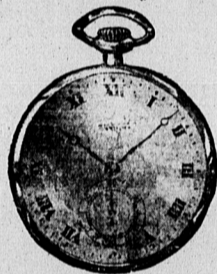
2nd PRIZE—PROVINCIAL FINAL GOLD WATCH