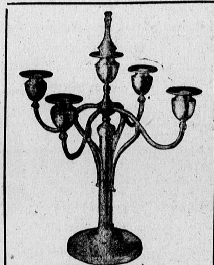
1st PRIZE—PROVINCIAL FINAL SILVER CANDELABRA