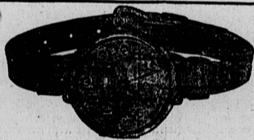
3rd PRIZE—PROVINCIAL FINAL GOLD WATCH