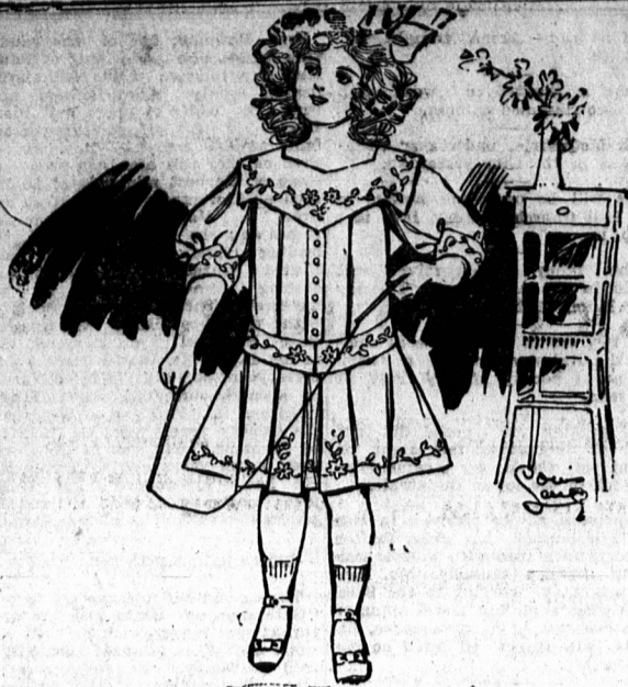
This stylish little dress is made of brown cloth, cut with two box pleates back and front and flaring wide at the sides. A simple design in colored ribbon work makes the dress very attractive. The leaves are in dull green and the daisies white with yellow centres.