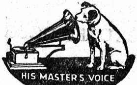
Victor Talking Machine Company of Canada Limited