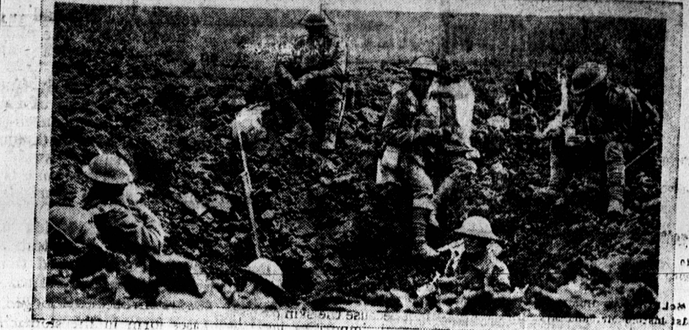
IN THEIR OWN HOLE This shell hole, where Canadians are resting after an attack, was made an hour or so before by their artillery.