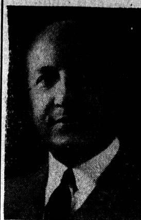
ALLAN BRONFMAN of Montreal, prominent Canadian industrialist and community leader, upon whom the French Government recently conferred the title of Chevalier of the Legion of Honour.

Established business requires heated office and shipping space, 500-600 square feet on ground floor with delivery entrance. Apply to: MATHESON & PEAKE