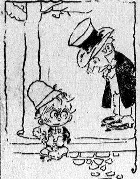
"Why don't you wash your face?" "Aw say! Do you tink dis is Saturday?"