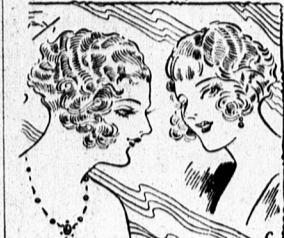
WOULD PROBABLY NOT WED Dora: "I'll never marry a man 'ho'd tell me anything but the truth." Flora: "You've made up yo' mind to be an old maid then?"