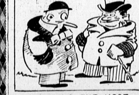
ROLLING THE HOSE "The young ladies are going to form a volunteer fire company." "Gotten expert in rolling the hose, I suppose?"