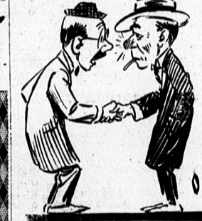
TOUGH "Have any luck on your hunting?" "p, Zeke?" "Naw, not a drop."