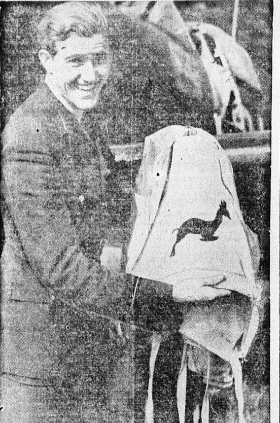
It took this South African pilot half a minute to shoot down two ME 109's over the Channel at lunch-time recently. He was flying a Spitfire of the R.A.F. Fighter Command, and after the dogfight he reported to his base by radio-telephone. The controller answered, "That's all right, laddie. Come home." Within 20 minutes of leaving his base he had returned. His score is four, plus a probable, and five imagined. He here shows his "Mae West" with a Springbok stencilled on it.