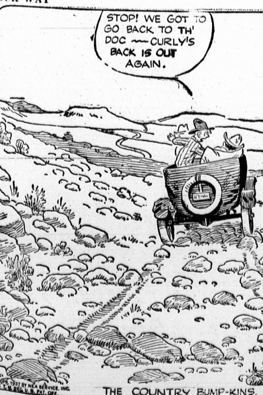
THE COUNTRY BUMP-KINS.